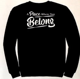
Long Sleeve T Shirt